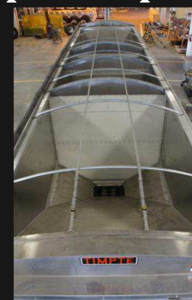
A three and four compartment available.