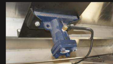
Air operated vibrators improve product clean out, and can be mounted on all hopper tubs.