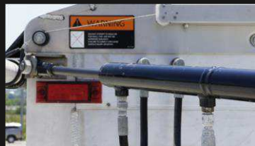
Hydraulic sway control raises and lowers the upper auger tube, and keeps it stable while in transport mode.