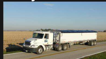
Belt system can be removed in about one hour and the trailer can be used as a standard conventional grain hopper.