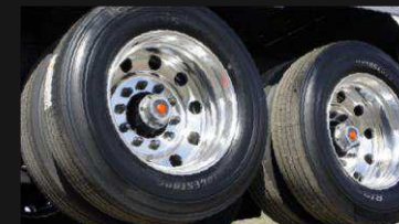
For less weight and more payload many customers choose all aluminum wheels.