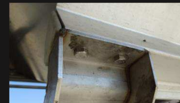
Removal of 12 bolts makes it easy to disconnect the lower belt assembly.