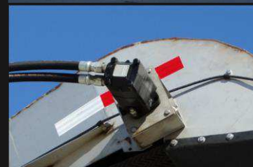
The upper and lower assembly units utilize hi-performance Parker hydraulic motors.