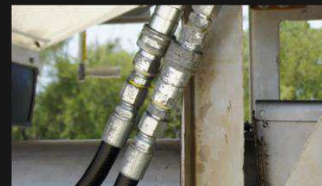
Timpte utilizes quick couplers for removal of all hydraulic hoses.