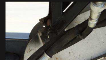
Removal of the upper belt assembly consist of removing a single pin at the transition and unhooking the hydraulics.